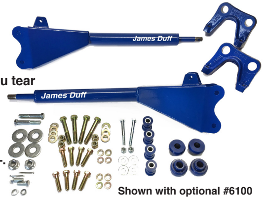
Shown with optional #6100

NOTES: Lay out and verify all parts you may need are accounted for before you tear down your Bronco. This is especially important if you have a rented space or if a mechanic/shop is doing the install. We recommend that you have a caster reading taken at a front end alignment shop before installation to assure you have the proper degree bushing, so you won't be held up waiting for them or have to tear it back down and reinstall. We recommend a reading of 3.5 to 4.5°+. Too much or too little will result in caster shimmy or wandering. Take into consideration when calculating for the proper bushings, there is 4.25°+ built into these arms. Also, give your track bar a quick shake and inspection to check the condition of the bushings. It will be disconnected and they'll be easy to replace.